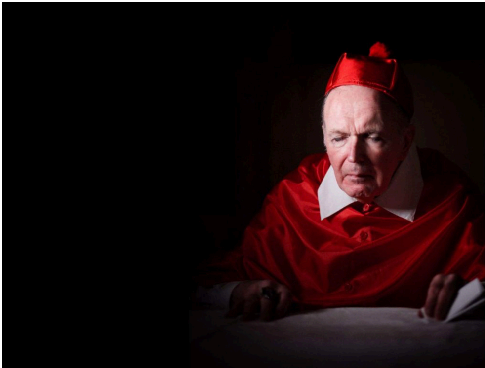
Still from Roi Shortlisted for the Swedenborg Film Festival