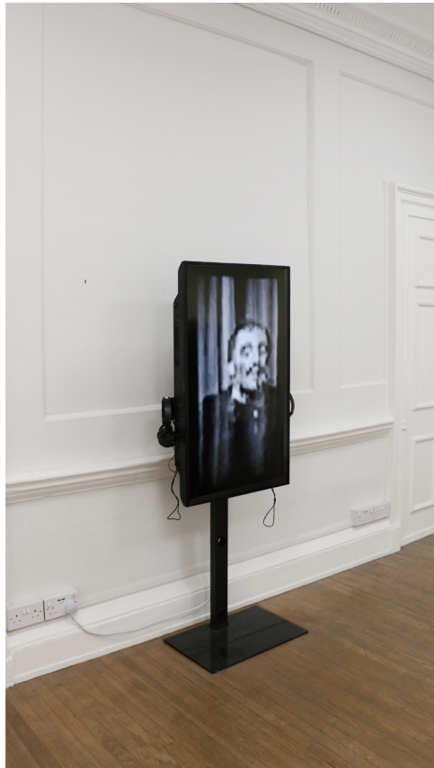
Installation view Tremulations © The Quinn Fizzlers