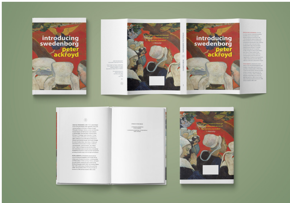
Cover designs for Introducing Swedenborg by Peter Ackroyd