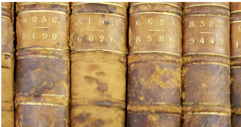
First edition bindings of Swedenborg's Arcana Caelestia