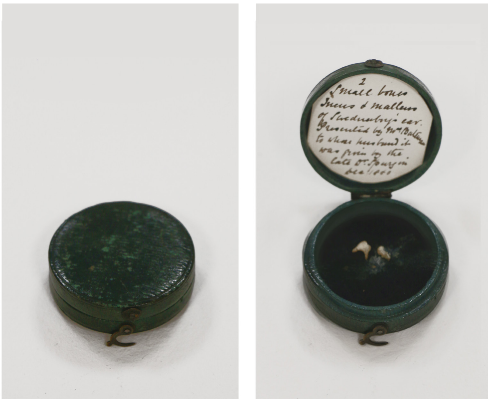
Swedenborg's Earbones.

The Society is working on an ambitious long-term plan to produce podcasts, round-table discussions, interviews, audio artworks, readings, audio books and musical events for 'Swedenborg Radio'. More information regarding these plans will be forthcoming in the 2024 report.